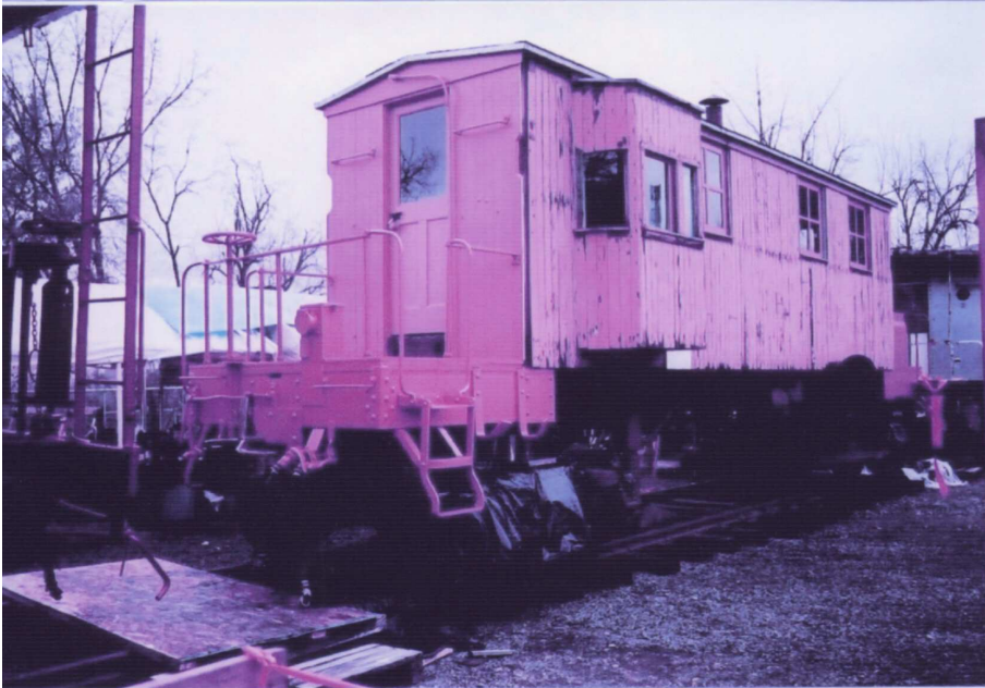
The top four photos show a little of the progress on our new concession stand. (Top left) Rickie Aubin is securing sheetrock. Steve Bruff is shown cutting the sheetrock to size at bottom left. The bottom photo shows one end of SP flanger SPMW330. Notice fresh paint has been applied to the metal ladders, frame and railing. The same thing was done on the other end by Steve Bruff.