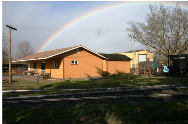
(BELOW LEFT) A closer look shows some of the exterior brown trim that Steve and Rick installed during December. (BELOW RIGHT) We have converted half of the Mack Walch Library building into a winter workshop so a portable heater will keep the paint and volunteers from freezing.