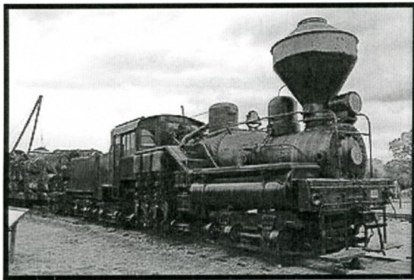
Willamette Locomotive no. 7, on static display at the Fort Missoula Museum.

The Willamette locomotive was a geared locomotive of the Shay locomotive type, built by the Willamette Iron and Steel Works of Portland, Oregon. Key patents on the Shay locomotive had expired, and it was now possible for other manufacturers to produce Shay "clones". The Willamette locomotive was very similar to a Shay, but had many differences, as the company that made them intended on making an "improved Shay", even though the "Pacific Coast Shay", later made by Lima, took up many of the features on the Willamette. The differences were: All Willamettes were equipped with superheaters, while Shays usually were not.