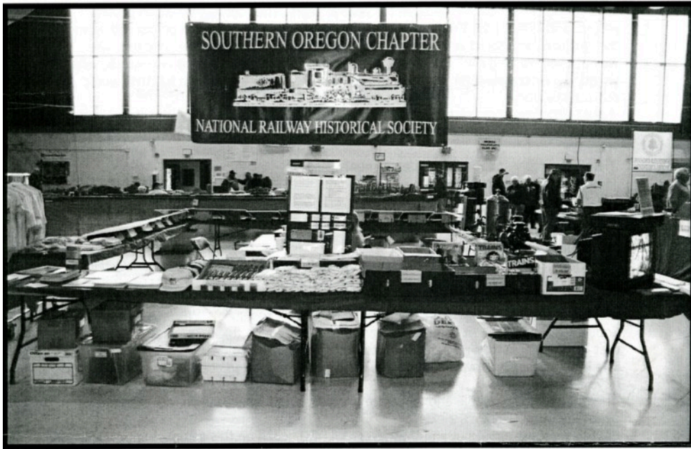
Old Time)' Display of Keen RR stuff.