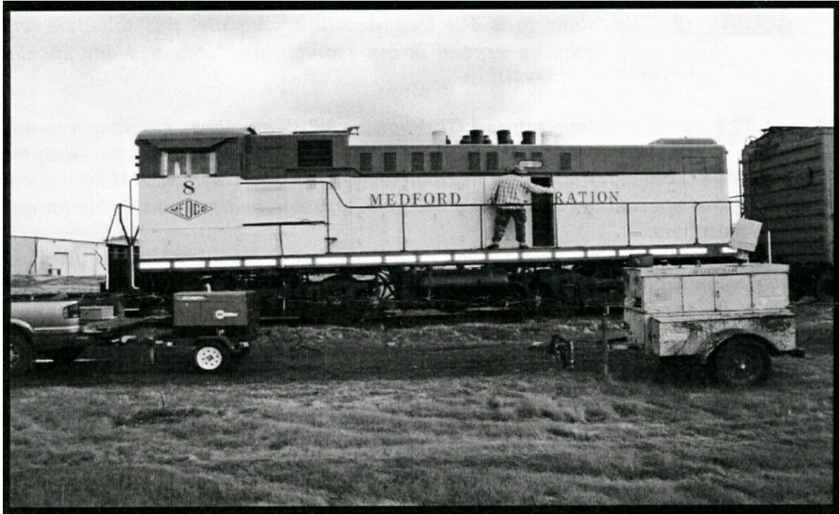
If you remove the late model pickup you would swear it was 1960 again