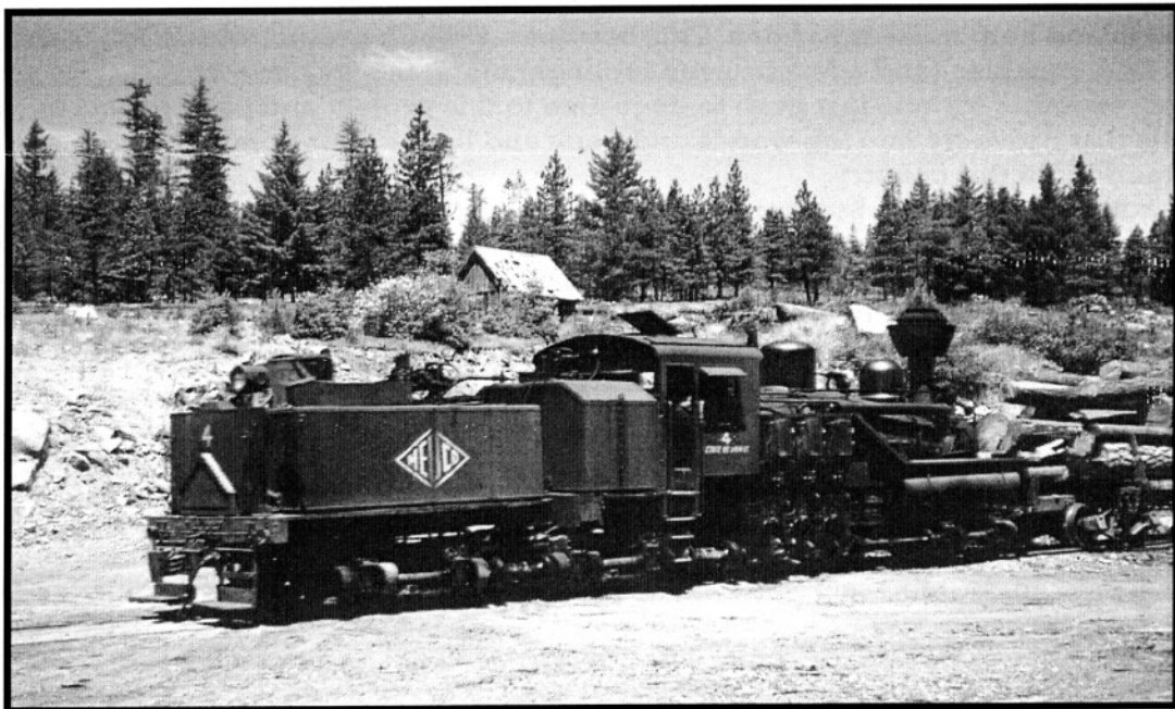
#4 Moving Some Loaded Flats

Water Water Everywhere But Not a Drop to Drink- Now that we are getting closer to completion of the Medco #4 project many of you have asked “what next?” At least initially the plan is to operate #4 at the railroad park if for no other reason than to do some test runs, tighten the odd bolt or two that may shake loose, take some pictures, shake hands and then move #4 to a permanent operational site. Since it became apparent that we would not be able to operate on the old Medco grade we have researched numerous other options with mixed results, we are currently in the process of revisiting some of those options with a new found determination to put #4 back on track. Anyone that would like to assist in this effort please contact me... Editor