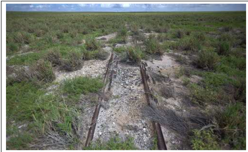
The tracks were never taken up and still remain on the island, clear a little brush and it looks like we could give it a try.

This tramway remained in use on Malden as late as 1924, and its roadbed and tracks still exists on the island today. If you open Google earth to Malden Island you can still see the tracks and some of the infrastructure of the old guano operation. The railroad extends about halfway around the island but at one time the plan was to completely circle the island as the grades and roadbed were completed. During the mining operation reports indicated that in the heavy nesting areas the guano was in excess of 2 feet deep, that's a lot of guano. The supply was never completely exhausted but other more easily obtained sources became available and operations ceased around 1927.