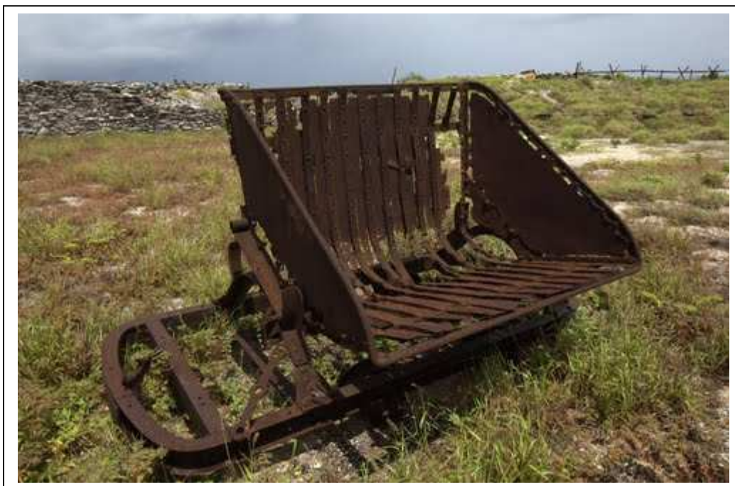
One of the side dump guano cars minus the wheels and sail, the sails were square rigged and quite large and by first hand account allowed for an "exciting" ride back to the processing plant at the end of the day.