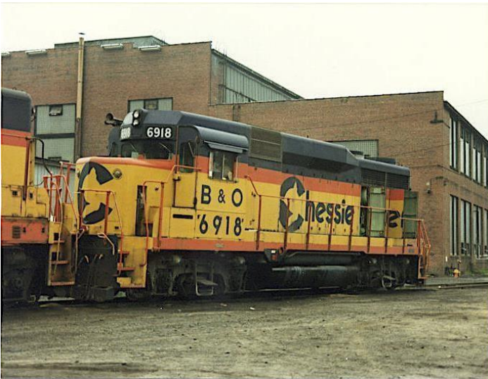
6918 shown here in its Chessie paint scheme